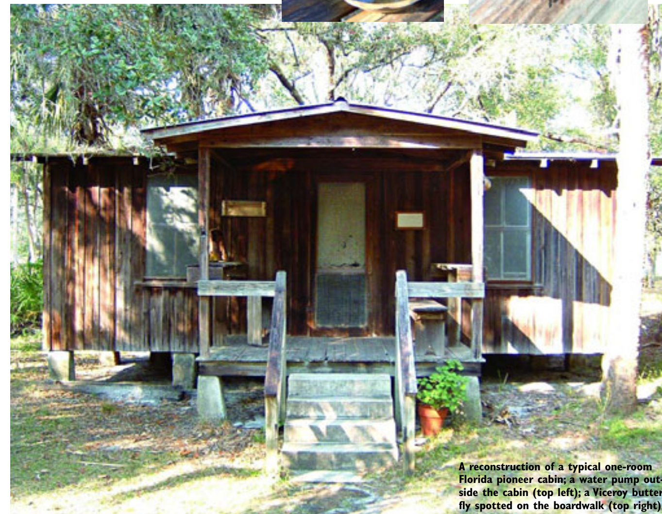
A reconstruction of a typical one-room Florida pioneer cabin; a water pump outside the cabin (top left); a Viceroy butterfly spotted on the boardwalk (top right)

At the same time, the center acts as a nature preserve, protecting 190 acres of Florida wildlands that range from pine forest to open river. And I hadn't even