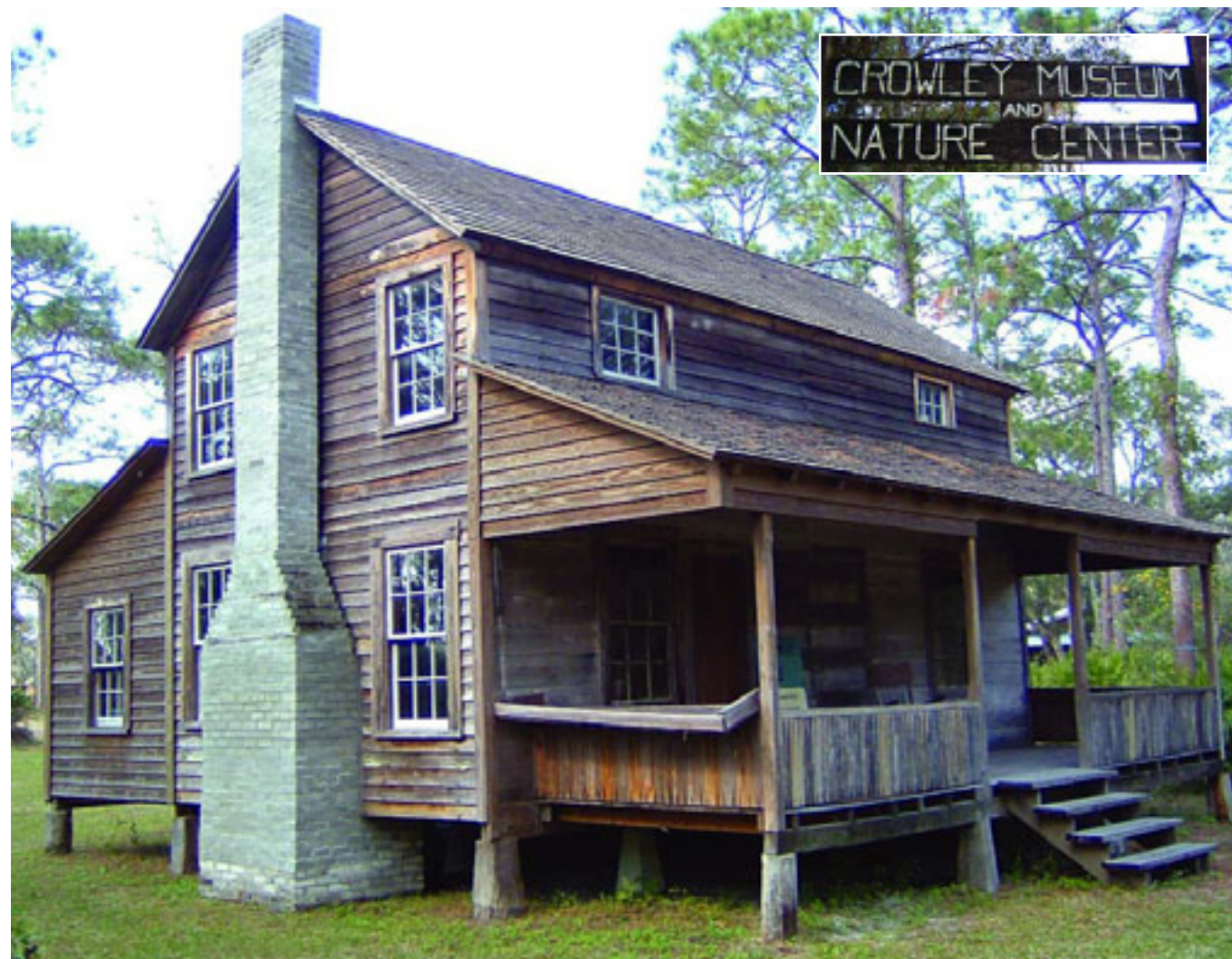
The circa-1889 Tatum House forms the centerpiece of the Crowley Museum and Nature Center's Pioneer Area.