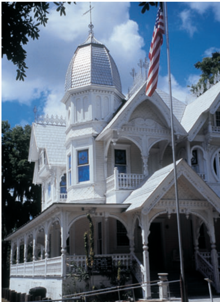
New England- and Victorian-style structures, such as this restored beauty, add to Mount Dora's charm.

here today." Parking in a neighborhood near the top of the hillside, we admired well-kept homes, tidy gardens with azaleas in bloom, and a number of residents actually greeting visitors.